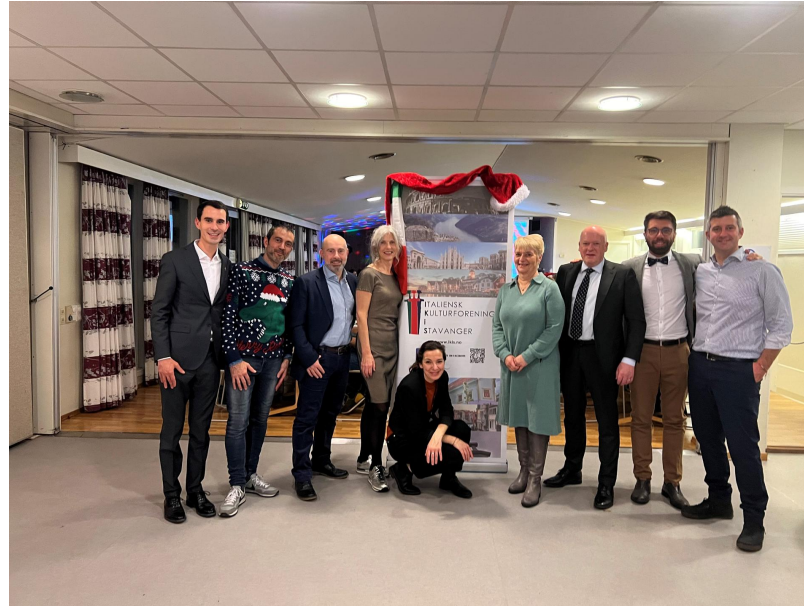
IKIS board members during the annual Italian Christmas party organized in Stavanger-Dec 2023